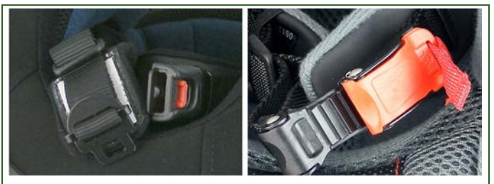
Figure 3: Quick release buckle and micrometric retention systems.

However, operation of the Double-D ring retention system is not intuitive to a novice user, who will require some education on its operation. Without training many new users will fail to secure their helmet, which can lead to inadvertent ejection of the helmet. Such user error was reported as the number one cause of crash-related motorcycle helmet ejections in both the United States Hurt study and European MAIDS study [1,2]. This has given rise to alternative, simpler retention systems, such as quick release buckles and ratcheting (micrometric) fasteners, though mechanical failure rates of these devices tend to be higher, particularly for products with non-metal components (Figure 3).