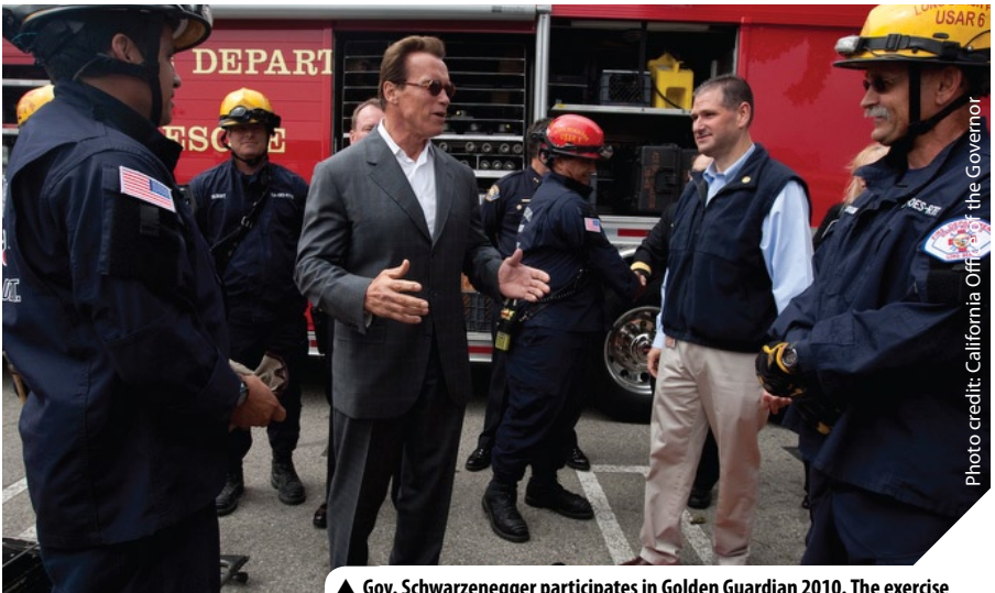
▲ Gov. Schwarzenegger participates in Golden Guardian 2010. The exercise focused on multiple terrorist attack scenarios at California seaports.