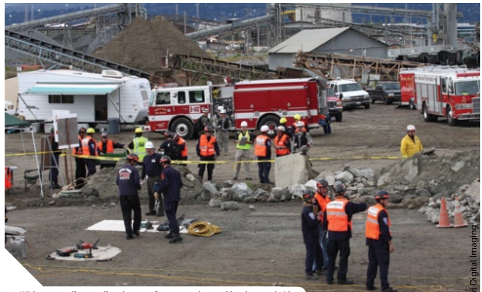
▲ With rescue efforts well under way, first responders and local mutual aid departments await their assignments from Incident Command.

A simulated pipe failure at the Valero Oil Refinery releases thousands of gallons of gasoline and prompts the evacuation of the refinery and a nearby bridge closure.