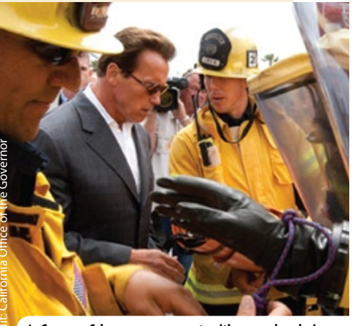
▲ Governor Schwarzenegger meets with responders during the Golden Guardian 2010 exercise. Following a briefing on the exercise, the governor toured drill activities and held a media conference.