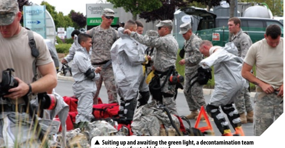
prepares to confront a biohazard.

A Port of Long Beach Marine Transportation System/Recovery Unit tabletop exercise takes place in Long Beach.