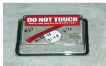
Fig. 2: Typical calcium chloride test kit containing a dish, calcium chloride crystals, and a plastic dome

moisture vapor in the air beneath the plastic dome. At the end of the exposure period, the difference between the initial and final weight of the crystals is used to calculate the MVER in pounds of water per thousand square feet per 24 hours (commonly referred to simply as “lbs”).