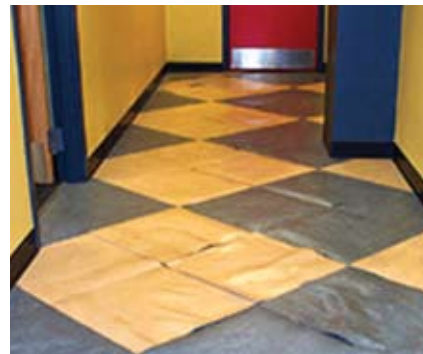
Fig. 1: Problems such as these warped and bubbled floor tiles can be caused by moisture and moisture-induced high pH levels beneath the flooring materials

To understand what happened on this project and many others, we must examine a test method that is commonly used in the U.S. to quantify the moisture vapor emission rate (MVER) of a concrete subfloor. The method, the calcium chloride test developed by the Rubber Manufacturers Association (RMA) in the 1950s, is now published as ASTM F 1869 1 by ASTM International. MVER testing by the calcium chloride method involves placing an open dish containing a specified, known weight of anhydrous calcium chloride crystals beneath a plastic dome that is sealed to the concrete surface for 60 to 72 hours (Fig. 2). During the test, the crystals absorb