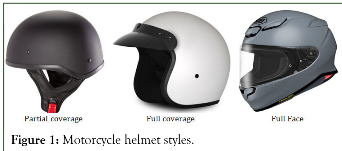
Figure 1: Motorcycle helmet styles.

Motorcycle helmets are typically grouped into three categories: partial coverage (aka shorty or half) helmets, which, by design, do not extend over the rider's ears; full coverage (aka three-quarter) helmets, which extend over the rider's ears and further down the back of the head, but offer no face protection; and full-face helmets, which are similar to full coverage, but also include a chin bar to afford some protection against facial impacts (Figure 1).