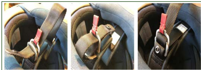
Figure 2: Operation of Double-D ring helmet retention system.

Motorcycle helmets are secured to the rider's head by means of a retention system. The most common retention system utilized on motorcycle helmets involves a strap, originating from one side of the helmet, which is secured to the opposite side using a 'Double-D ring' mechanism. The retention strap is passed through the centers of the two D-rings, then over the outer ring and back through the inner ring (Figure 2). It is well accepted that motorcycle helmets may be ejected from a rider's head during a collision event due to user error, mechanical failure, or design defect.