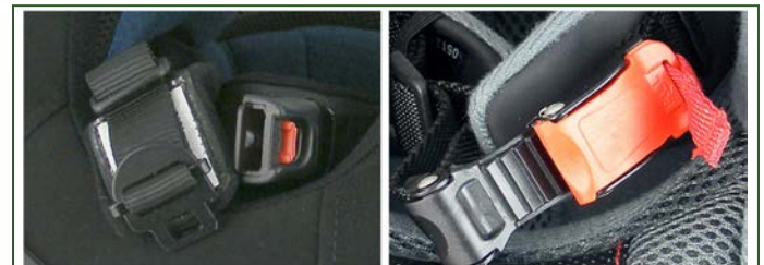
Figure 3: Quick release buckle and micrometric retention systems.

However, operation of the Double-D ring retention system is not intuitive to a novice user, who will require some education on its operation. Without training many new users will fail to secure their helmet, which can lead to inadvertent ejection of the helmet. Such user error was reported as the number one cause of crash-related motorcycle helmet ejections in both the United States Hurt study and European MAIDS study [1,2]. This has given rise to alternative, simpler retention systems, such as quick release buckles and ratcheting (micrometric) fasteners, though mechanical failure rates of these devices tend to be higher, particularly for products with non-metal components (Figure 3).